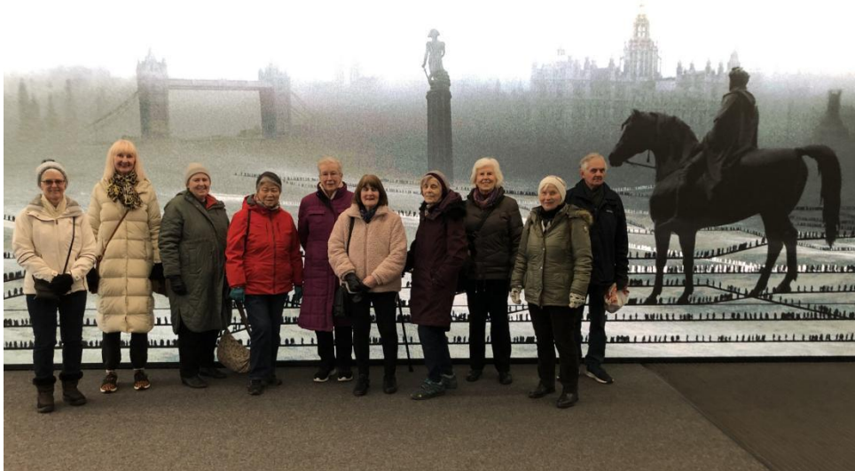
London Explorers group trip to the Elizabeth Line in murky January.