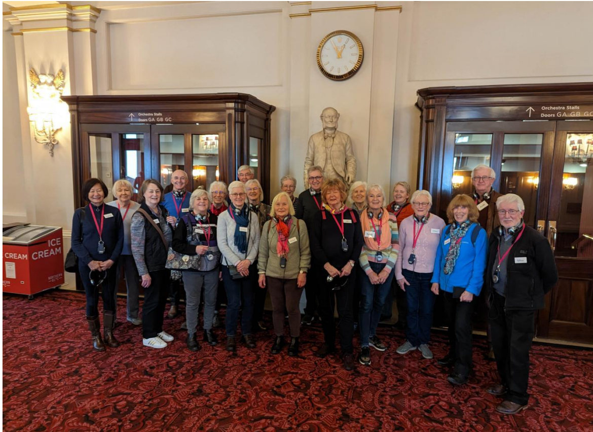
London Explorers March visit to Royal Opera House