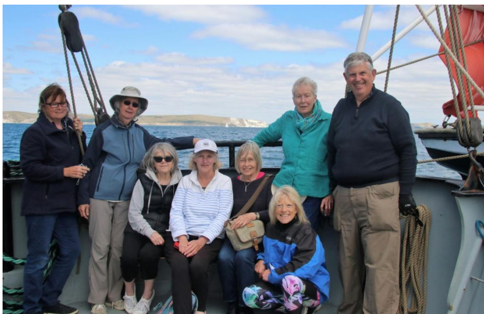
Bucket List group members aboard the sailing ship, Moonfleet, in Weymouth Bay.