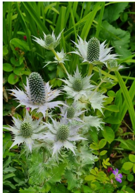
Ornamental thistles at Hidcote NT Gardens