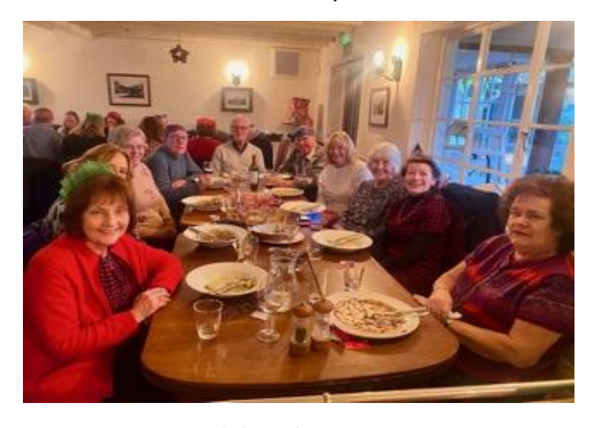
and the other group...

!Que aproveche! The two Spanish for Holidaymakers groups out for a Christmas lunch at the Royal Oak in Ruscombe