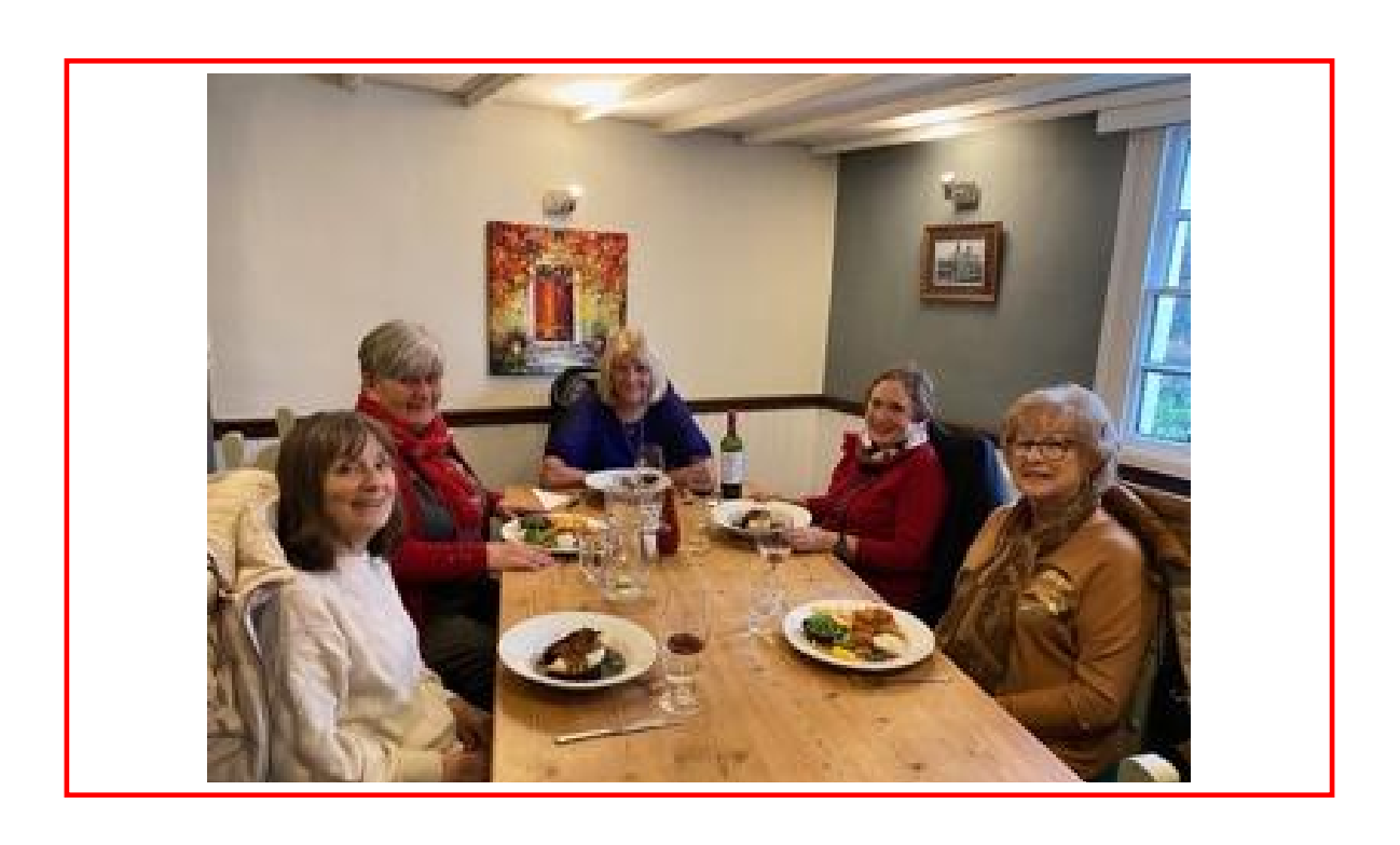
The Christmas Party 2023