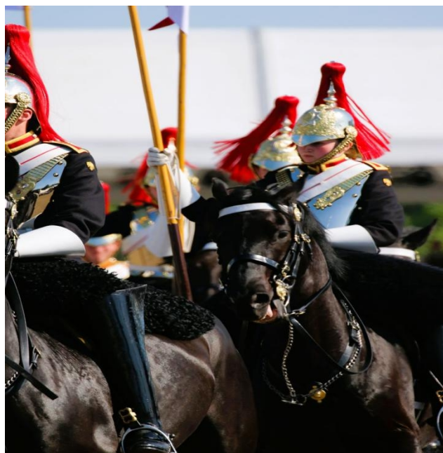
Royal Windsor Horse Show