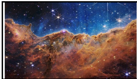
"Cosmic Cliffs" in the Carina Nebula

The talk will be held at the Desborough Bowling Club at 10 Green Lane, Maidenhead SL6 1XZ. Please aim to arrive between 2.00 and 2.15pm. To avoid problems with parking, please share rides if possible . You may park in the spaces for buses. If the bowling club car park is full, you can park in front of Lidl or Homebase which are a short walk away for up to two hours, ideally having made a purchase.