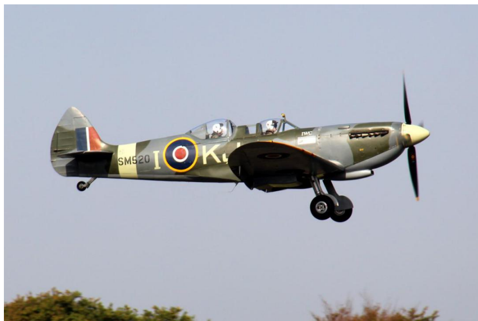
A Spitfire at Lee on Solent on 16 th September