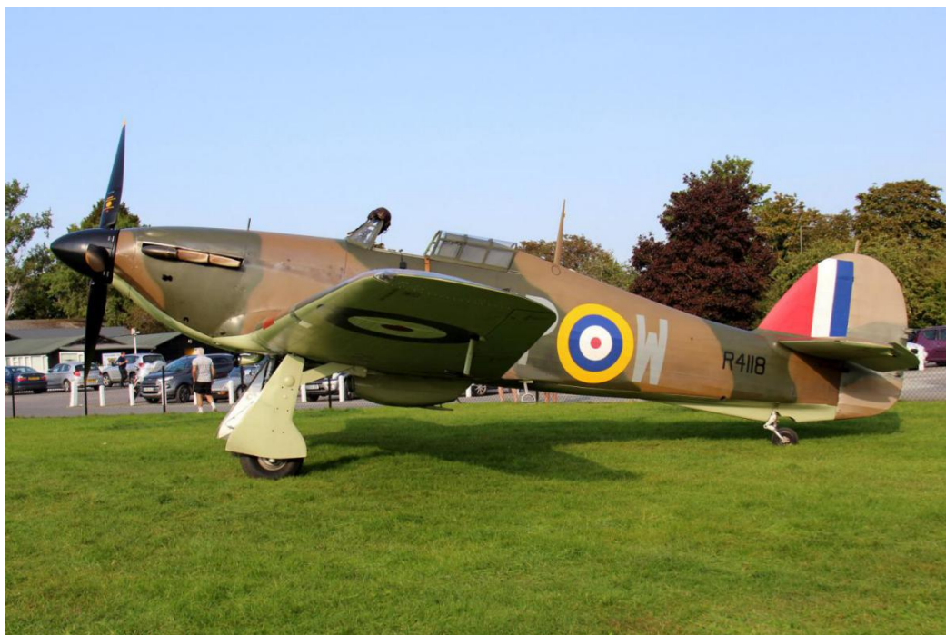
A Hurricane at White Waltham Airfield, 19 th September