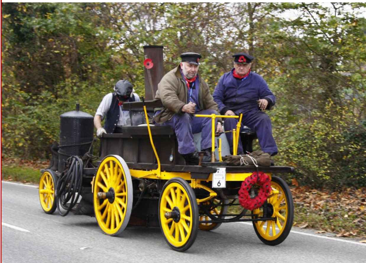
1895 Salvesen coal-powered steam car. It has a driver up front and a boilerman keeping the fire stoked.