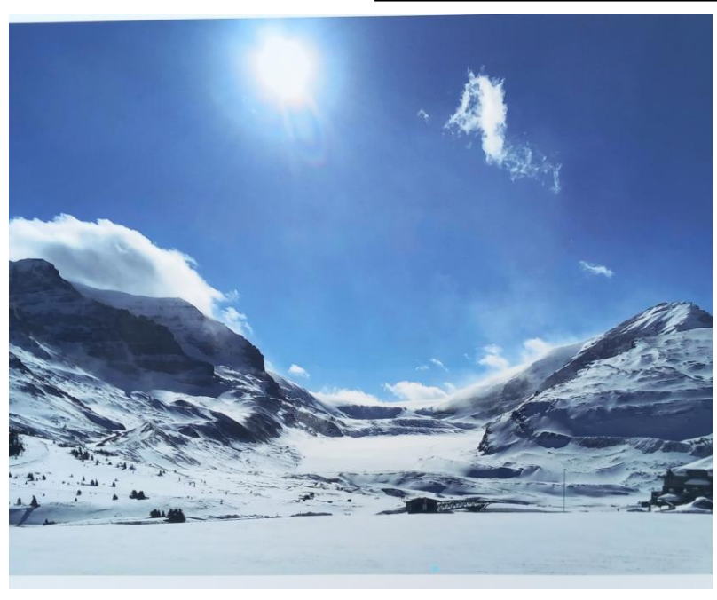
Bucket List Destinations?

PLEASE ADVISE OF ANY SPECIAL DIETARY NEEDS.