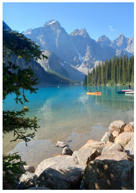
Lake Louise, Banff, Canadian Rockies

Athabasca Glacier, Canadian Rockies